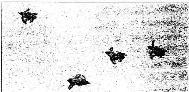
Figures 1-4. This series of photos detail the lives of loggerhead turtles at John D. MacArthur Beach State Park, FL. Female loggerheads build a nest in the beach (top photo) and lay their eggs in the sand (second photo from the top). If raccoons or other predators find the nest, eggs will be eaten (second photo from the bottom), otherwise, hatchlings will emerge and head towards the ocean (bottom photo).