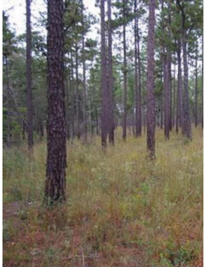
A frequently burned longleaf pine stand in Alabama with grass-dominated understory that produced very little crown scorch when prescribe burned.

due to low fire intensity and natural fire protection traits which provide a high tolerance to crown scorch. Proportion of crown scorch was also assessed using two models. Results indicated that proportion of crown scorch was not an effective predictor of longleaf pine mortality. Overall, the data showed that proportion of crown scorch and complete crown scorch are not good mortality indicators nor are they the primary causes of fire damage in longleaf pine trees.