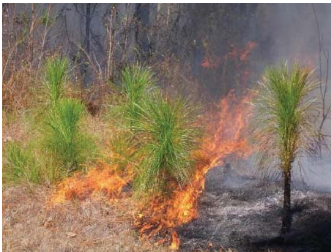
In the Kisatchie National Forest in Louisiana, young longleaf pine trees withstand the heat from a prescribed fire.

Although the situation may seem grim, there has been a recent boost in pursuing the longleaf pine species as both an economic and ecological resource, helping to stimulate management and restoration efforts and positively alter its endangered status.