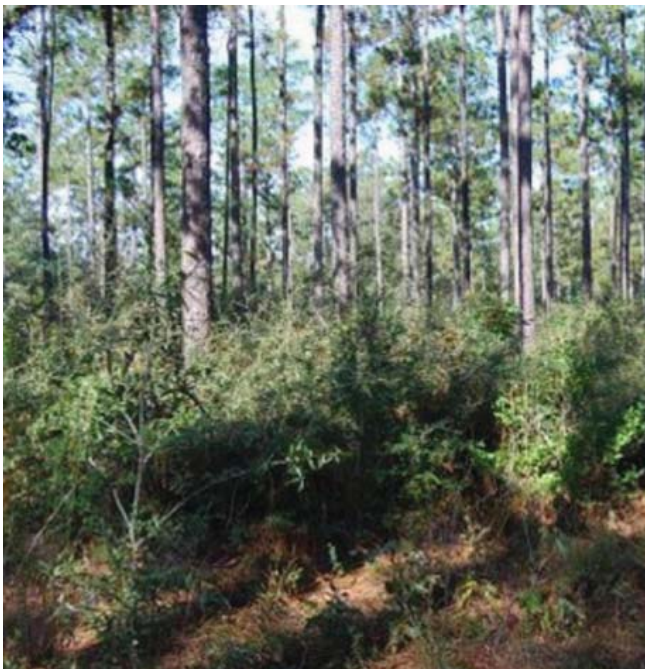
A long unburned longleaf pine stand in Alabama with heavy accumulation of fuel.

The fire regime in longleaf pine forests typically consists of low intensity surface fires. According to the data collected in this study, 72 percent of trees did not record any crown scorch during prescribed fire. This is most likely