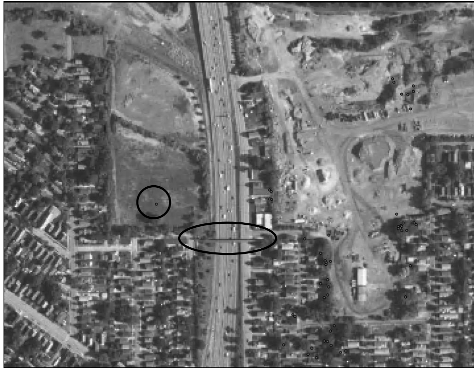
Figure 2. Raccoon ( Procyon lotor ) location across an interstate highway, showing pedestrian crossing bridge, Cleveland, Ohio, USA, May 2009 to March 2010.