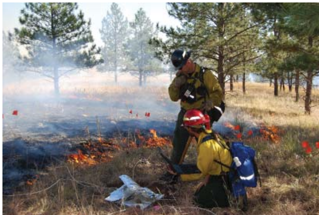
The experimental plot included simulated near-surface artifacts and temperature sensors to collect fire intensity and duration data.

The project team conducted the prescribed fire experiments at all of the parks between 2006–2009. Data on fire temperature and duration were recorded for all of the prescribed fires. Ignition of individual plots was done using head, flanking and backing fires. Following the fires, the artifacts were collected and subjected to detailed analysis, comparing post-fire condition with pre-fire condition.