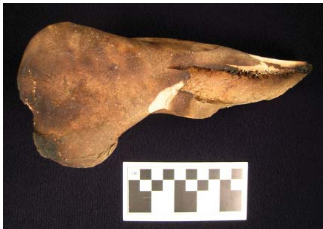
Some types of sample artifacts studied did show effects from prescribed fires. Here a bison bone shows the burn impacts of combustive residue and scorching.

Analysis of the effects of the prescribed fires on the artifacts has some expected results and surprises. Significant impact to an artifact was defined as irreversible change to the object and loss of its inherent information potential, destabilization that would lead to degradation, or complete destruction. Using this standard, the majority of artifacts did not exhibit significant impacts.