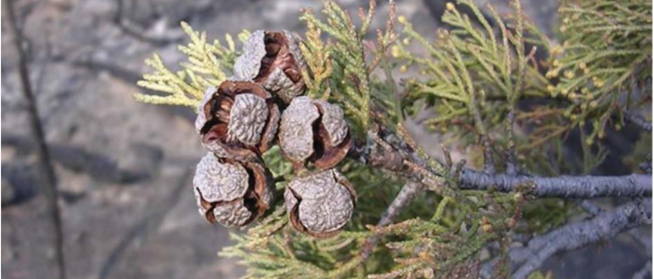
Baker cypress cones opening after the 2006 Titus Fire.