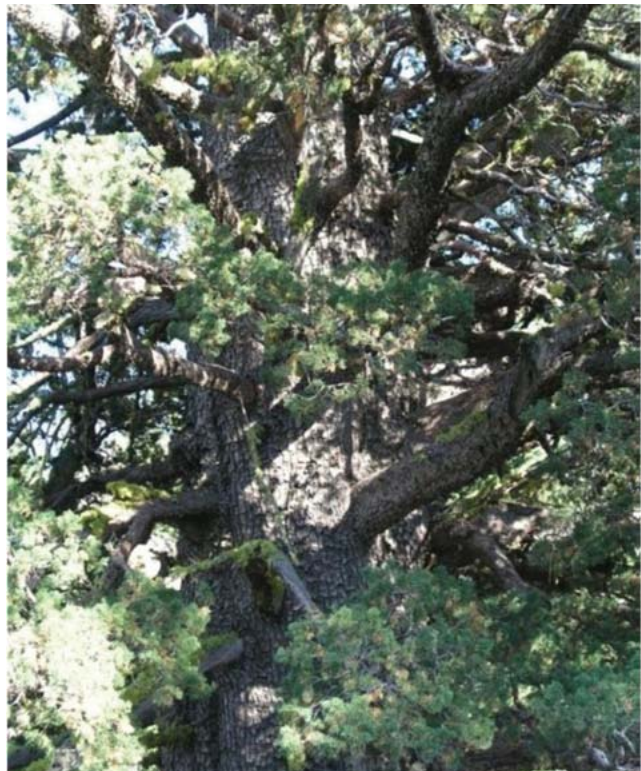
Baker cypress champion tree, Wheeler Peak.