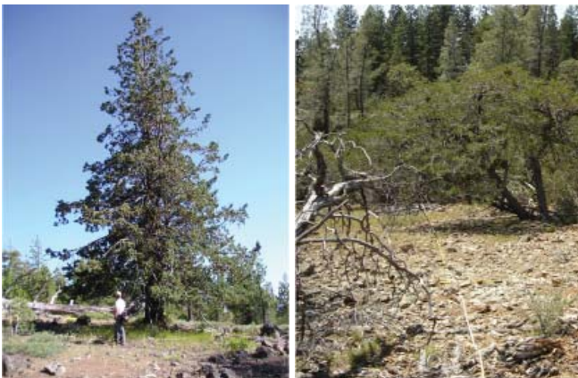
(Left) Baker cypress and (right) Macnab cypress. The Baker cypress is 140 years old and the Macnab is an impressive 289 years old.

Macnab cypress ( Hesperocyparis macnabiana ) has approximately 30 populations across 12 counties in California and grows at elevations from 1,000 to 2,800 feet. Baker cypress ( Hesperocyparis bakeri ) occurs in 11 widely scattered locations across the northern Sierra Nevada, Cascade, and Siskiyou mountain ranges at elevations from approximately 3,700 to 7,000 feet. Although Baker cypress does not have state or federal listing as an endangered species, it is classified as a California Native Plant Society list-4 species (species of limited distribution) and a Special Target Element in Forest Service Region 5, meaning that its uncertain future calls for special attention in management planning. So, we know that we need to carefully plan the management of these rare cypress populations, but what is it specifically that we need to be doing to preserve the species?