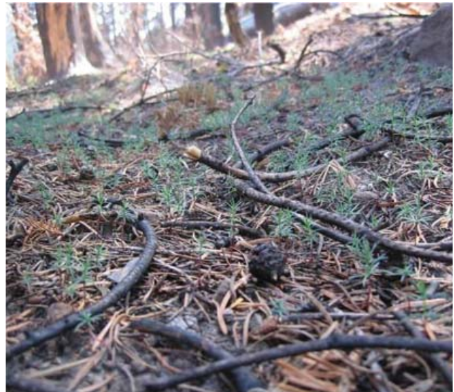
Baker cypress regeneration after the 2007 Moonlight Fire on the Plumas National Forest.

"The wildfire was incredibly beneficial for that population. We saw great regeneration rates—the seedlings came back the very next year. And we didn't see one single white fir seedling. But there were hundreds of thousands of Baker cypress seedlings. Just a carpet of them."