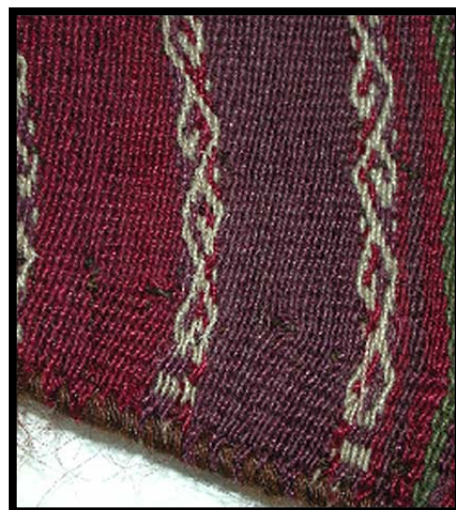
Figure 3. Detail, MMA tunic, showing lower edge curve with wefts turning mid-way.

When we look at the curve of the lower edge in the MMA tunic, it is possible to see that the shape is caused not just through distortion or tension of the yarns, but was formed by the fact that the warp yarns in the central area of the tunic are slightly longer than those at the sides. Here, the weft yarns do not pass across the entire width of the garment, but turn back periodically, to build up the area (Fig. 3). The first lower five or six weft passes are continuous selvage to selvage, yet follow the curved path of the lower edge: then sequentially, rows are built up around the curve in the center, by turning back into the next shed as the curve increases, to fill in the gap and take up the slack and tension differential.