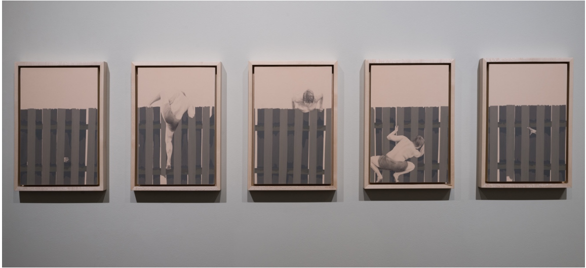
10. "From one thing to the next" Graphite and gesso on paper, mounted on panel 11 ½" x 15 ¾" 2018