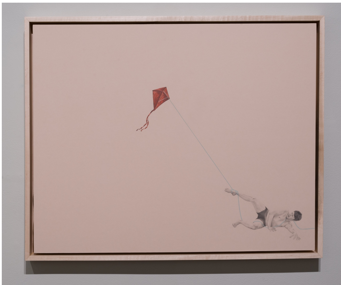
11. "I don't know how to let go" Graphite and gesso on paper, mounted on panel 28 ½" x 23 ½" 2018