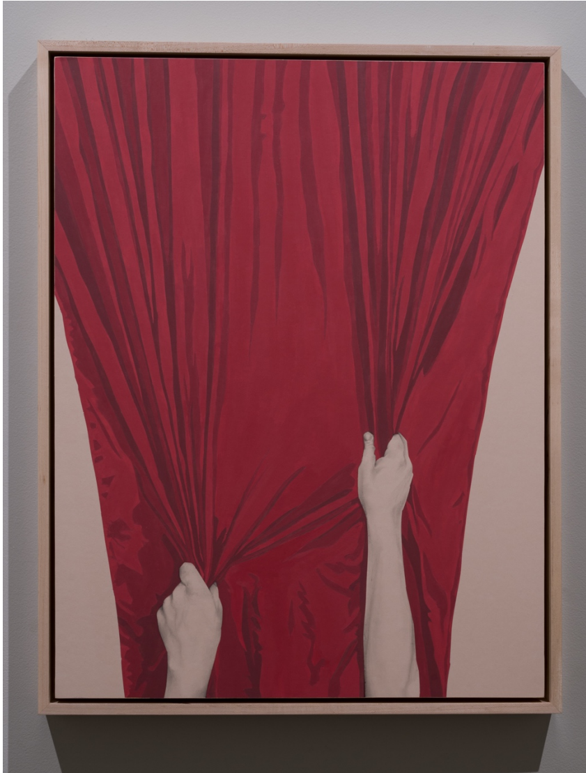
6. "I keep clinging to the way things were" Graphite and gesso on paper, mounted to panel 23 ½" x 30 ½" 2017