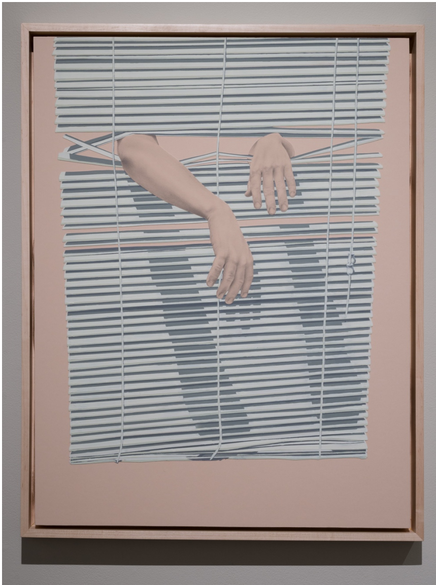
7. "Linger here" Graphite and gesso on paper, mounted on panel 23 ½" x 30 ½" 2018