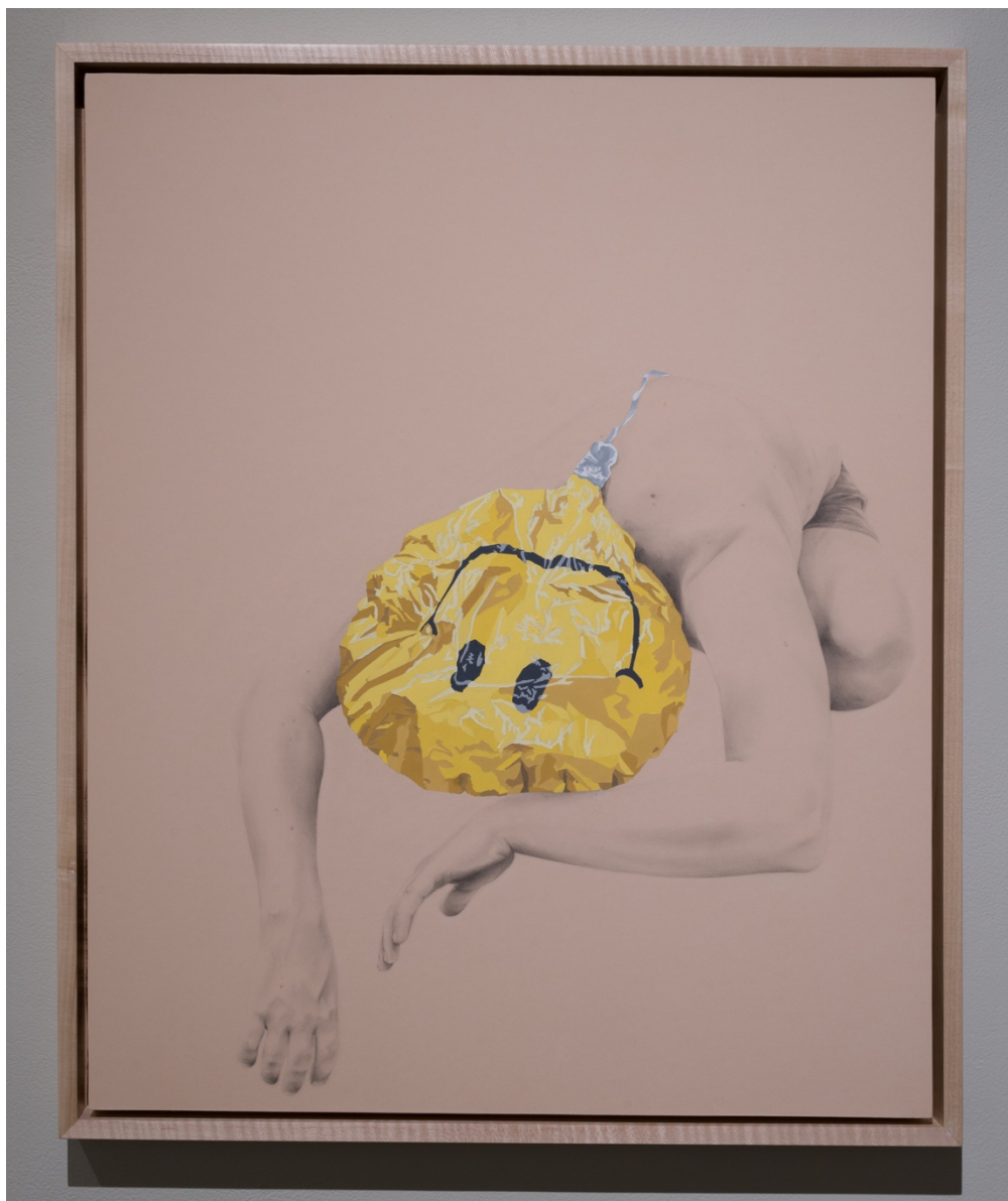
9. "You have to be okay" Graphite and gesso on paper, mounted on panel 23 ½" x 28 ½" 2018