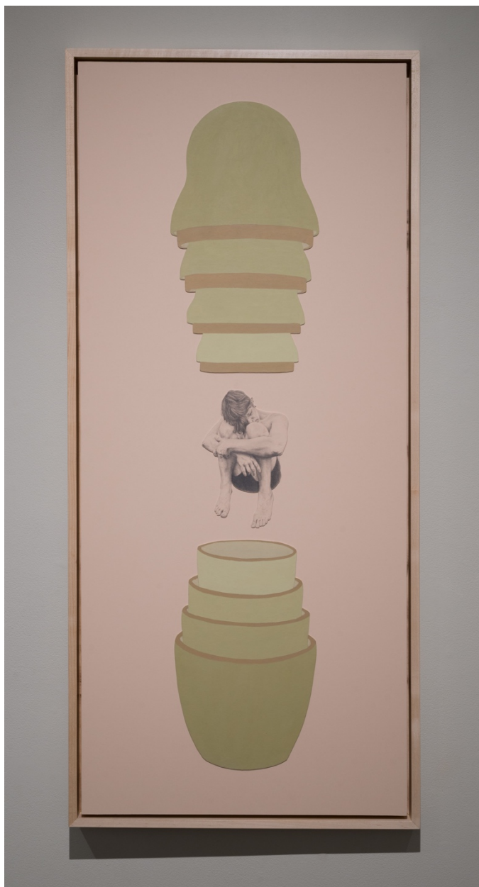
8. "Pause" Graphite and gesso on paper, mounted on panel 21 ½" x 47 ½" 2018