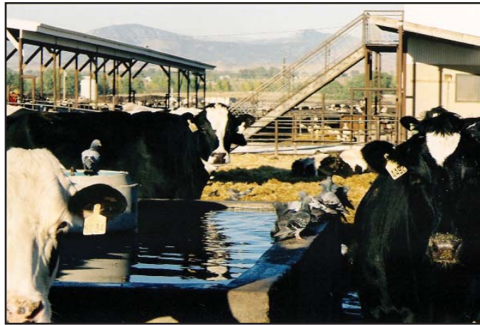
Pigeons and cattle.

In Italy, feral pigeons ( Columba livia ) were confirmed as natural reservoirs of STEC by isolation of STEC from fecal samples recovered from captured pigeons (Dell'Omo et al. 1998, Morabito et al. 2001). All of the strains produced shiga toxins, and most of the strains contained the eae gene and produced cytolethal distending toxin (virulence factors produced by a pathogen and necessary for causing disease in a host). Other studies have isolated STEC strains revealing toxins produced by the eae gene in pigeons (Wada et al. 1995, Schmidt et al. 2000, Pedersen 2004). Genomic subtyping has linked both pigeon and environmental isolates of E. coli O157:H7 to a common source in some instances (Shere et al. 1998). Because pigeons often live in close association with cattle year-round, the possibility of cross-contamination is high.