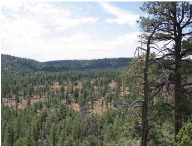
Mt. Trumbull study areas included a treated forest landscape (foreground) and an untreated control landscape (background).

Model simulations were projected in 10-year increments for 100 years into the future (2008–2108) using the Central Rockies/Southwestern Ponderosa Pine variant of FVS. The maximum stand density index when ponderosa pine composed 81–100 percent of the stand was 514 trees per acre, assuming trees of 10 inches dbh.