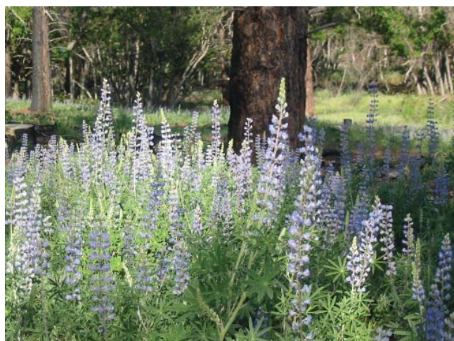
Ecological restoration efforts at Mt. Trumbull give vegetation and flowering plants such as this lupine a second chance to thrive.

It is critical for land managers to understand how today's management actions may affect long-term forest conditions—and to determine how to best maintain these forests as the climate changes. To help gain this understanding, researchers conducted a study at the Mt. Trumbull restoration site in northwestern Arizona. Specific study goals included using a forest simulation model to predict tree growth for 100 years under different climate and management scenarios and estimating changes in forest structure, biomass, carbon, and wood removed under those scenarios. After completion of the simulation part of the study, researchers planned to use the information obtained to compare management alternatives and to provide guidance on sustaining this landscape going forward.