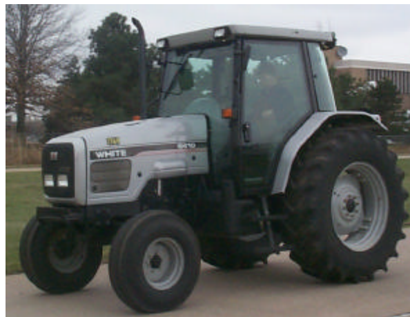
White 6410 Diesel