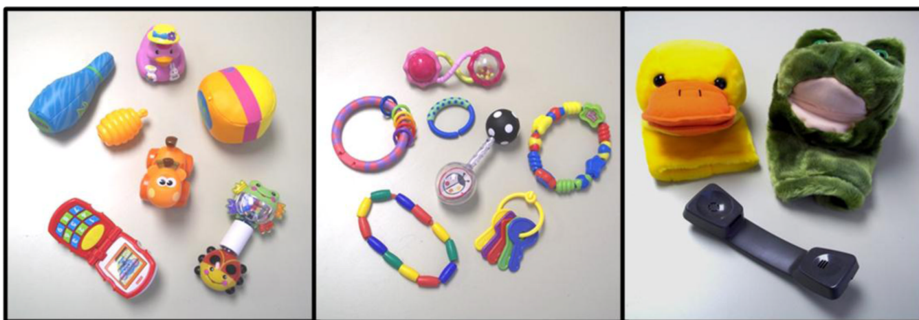
Figure 2. Test Conditions: LargePlay, SmallPlay, Social