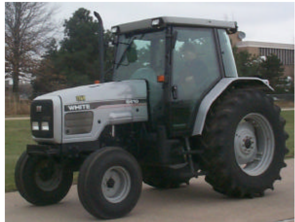
White 6410 Diesel