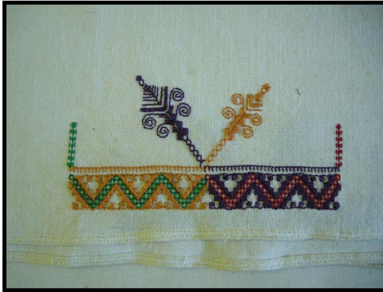
Figure 3. Detail of men's festival pants from Salasaca, collected in 1966. Cotton. The Textile Museum, Washington, DC 2001.2.1, Gift of Bernard Fiskien.

also a Spanish style. 2 Similar embroidery was done in the 1960s on the lower edges of Salasaca festival pants, and I assume that this wrap was also worn for festivals (Fig. 3).