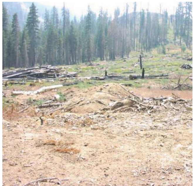
A treated area where fire-killed trees were logged after the 2002 McNally Fire.