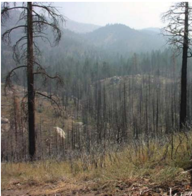
An untreated area after the 2002 McNally Fire.