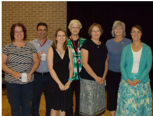
New Members who attended September Meeting