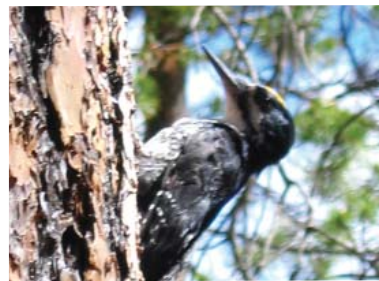
Black-backed woodpecker climbing a ponderosa pine four years after the Toolbox Fire in Oregon.

White-headed woodpecker displayed similar patterns in nest site selection as Lewis's woodpecker. The landscape surrounding white-headed woodpecker nests was open-canopied before and, consequently, after wildfire. The habitat at nest trees of white-headed woodpecker had fewer live trees per hectare and more decayed and larger diameter snags than at non-nest sites. They also used a mosaic of burn severities after wildfire.