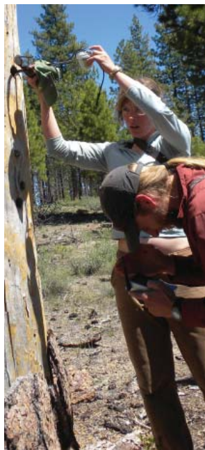
Individual nests were monitored with an electronic cavity viewer.

Black-backed woodpecker nest numbers in the area of the Silver/Toolbox Fire in Oregon were evaluated both before and after salvage logging operations, and these were compared with control areas in the same fire area that were not logged. Salvage logging slightly decreased snag density and average snag diameter, whereas coarse woody debris increased after logging.