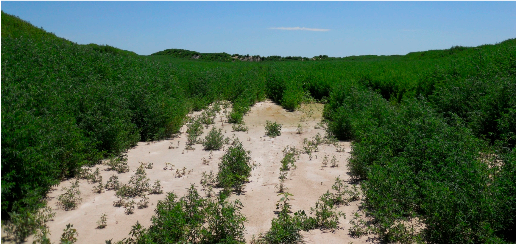
Figure 1. Kochia weed grown on precipitated calcium carbonate piles at sugar beet processing factory site in Scottsbluff, NE in 2011.