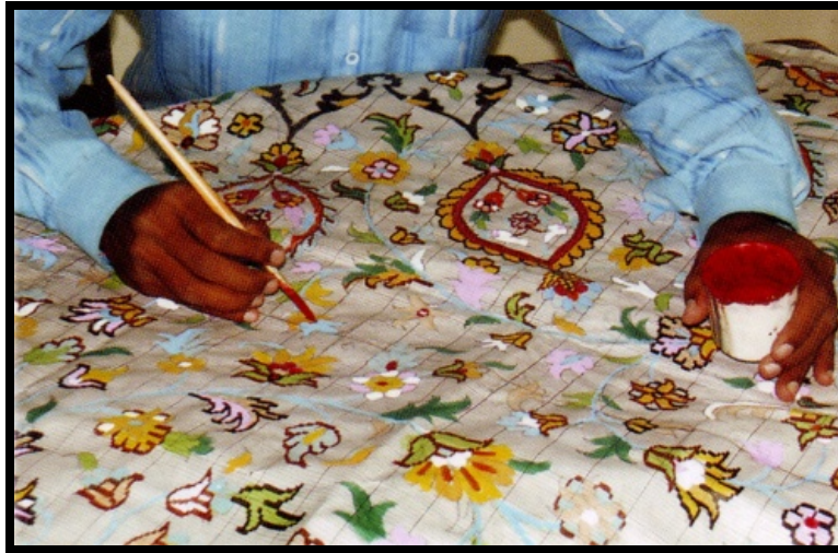
Figure 6. Painting the design.

take inspiration from prototypes, often looking at examples found in books with photographs of famous carpets found in museum collections.