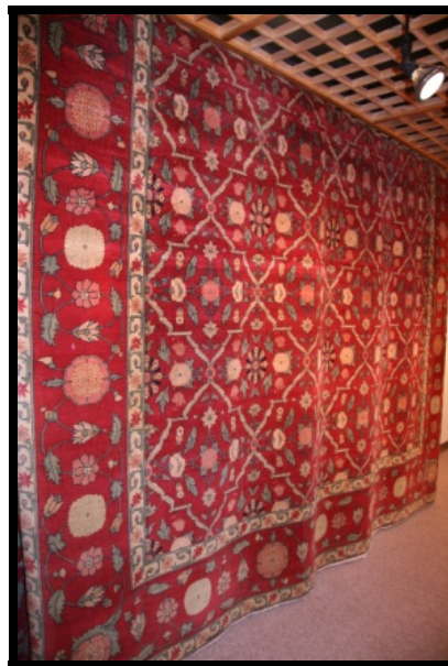
Figure 5. Carpet, Northern India, Early 20 th Century, cotton ground with wool pile.

During the reign of the fifth Mughal emperor, Shah Jahan (1628-58), flowers became a primary design element. Flowers moved out of the border and into the central field of paintings, carpets and textiles. The magnificent marble inlay at the Taj Mahal, built in 1635, shows Shah Jahan's preference for flowers as a primary subject. Two types of floral compositions predominated during his reign: floral sprays, readily identifiable as iris, roses, lilies, and peonies among other varieties; and trellis patterns, within which a blossom is featured. Both design styles are visible in this exhibition (Fig. 5).