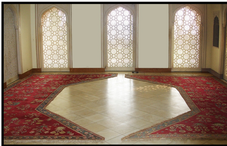
Figure 1. Pair of 17 th Century Mughal Carpets, Photographed in Doris Duke's Bedroom at Shangri La. Cotton, Silk, and Wool.

In addition to being historically significant markers of an aesthetic tradition, the carpets stand alone as important works of art due to their unusual shape and pairing. Each carpet has an arched interior with pointed ends. When paired, the carpets form a bold field of flowers with an interior void wherein a person, most likely of royal personage, could have sat in splendor. Imagine the feeling of wealth and luxury felt by those in the Mughal courts as they sat surrounded by effervescent flowers on carpets, textiles, architecture, and precious objects while ruling over a vast empire (Fig. 1).