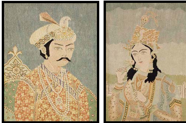
Figure 2. Pair of Embroidered Portraits, Northern India (Delhi,) CA.1850, cotton fabric with cotton embroidery.

In 1526, Babur, an emigrant prince from Central Asia, established the Mughal dynasty in South Asia. By 1600, the dynasty was both economically and politically prosperous, ruling a large geographic area divided today into Pakistan, Afghanistan, Kashmir, and Northern India. During their 330-year reign, the Mughals gained an international reputation for their wealth, tolerance, and intellectual and artistic pursuits. Their influence survives to the present in the word “mogul,” which denotes a lifestyle of power and luxury.