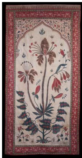
Figure 3. Tent Hanging, Northern India, 18 th Century, cotton with textile prints.

As a prince in Central Asia, Babur was accustomed to a semi-nomadic lifestyle. It was the practice of his ancestors to move their courts around the empire, and in particular to set up tents in gardens from which they would rule and entertain. One of Babur’s first acts in South Asia was to establish a garden, a practice his successors continued with increasing grandeur. Among the most visited Mughal gardens is that of the Taj Mahal, a mausoleum built in a garden complex by the fifth Mughal emperor Shah Jahan in 1635.