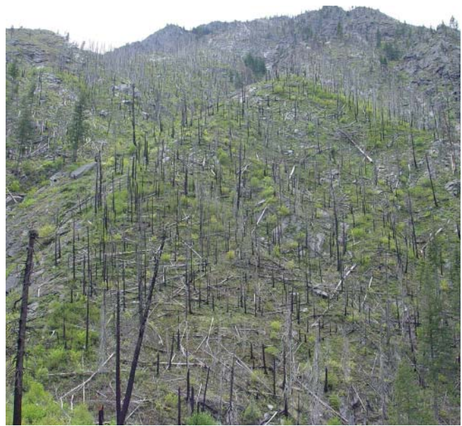
Snags and accumulating surface fuels 10 to 15 years after high-severity wildfire in Washington.

The period of greatest fuel loading was 15–30 years post-fire. Small- and medium-sized fuels typically peaked within 15 years, followed by a period during which fuel decomposition exceeded fuel deposition. Fuel loads were greatest in stands with more basal area killed. The amount of large fuels continued to increase for almost 30 years. Total loads remained high for about 40 years. Because this is longer than the historic fire return interval, heavy fuel loading leaves these areas vulnerable to uncharacteristically severe wildfire during this period.