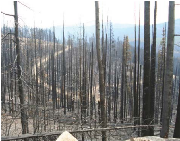
Snag stands produced by high-severity wildfire present high potential for future surface fuel loadings.

People engaged in the debate over post-fire logging tend to divide into two camps: those who favor timber utilization and those who favor letting natural processes take their course. Those who favor harvesting snags (fire-killed standing trees) after fire argue that it can generate income for the community and may help reduce the risk of insect and/or disease outbreaks. Those who favor natural processes complain that post-fire logging may increase the fire hazard in the short term by increasing surface fuels. Furthermore, they say that post-fire logging can harm soil properties; increase runoff and erosion, thereby harming water quality; degrade wildlife habitat; slow future forest growth; and aid the spread of invasive and/or exotic species. Focusing instead on fuels management may be a valid third perspective.