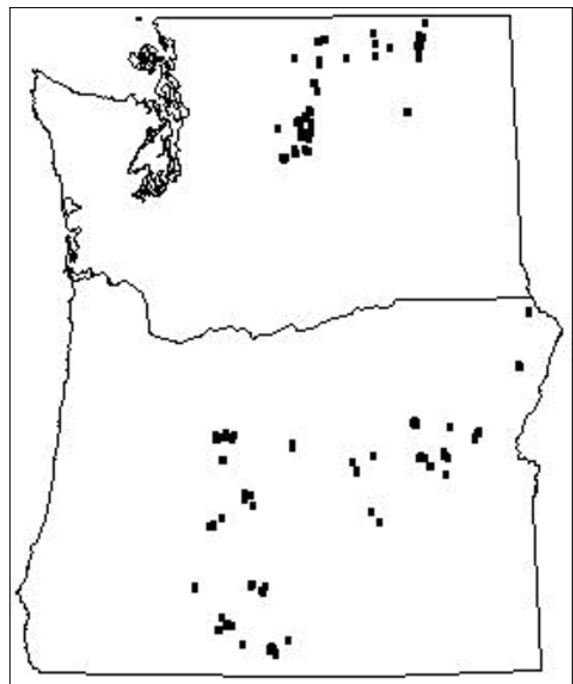
Study site locations in Washington and Oregon.

This study examined fuel succession in dry ponderosa pine and Douglas-fir forests in eastern Washington and Oregon. Such forests historically burned at low or mixed severity about every 3–36 years. A chronosequence of 255 sites was examined within the area of 68 stand-replacing wildfires with and without post-fire logging. At each site researchers assessed woody debris fall and decomposition; the effects of post-fire logging on fuel succession, potential fire risk, and long-term forest regeneration; and snag use by cavity-nesters.