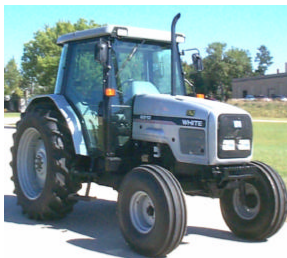
White 6510 Diesel