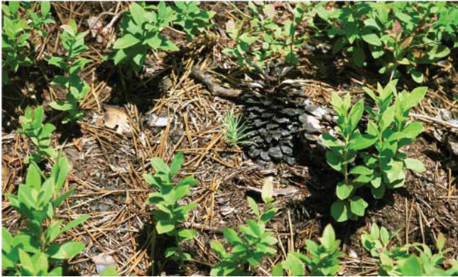
The beginning of a new stand. Photo shows a tiny seedling of Table Mountain pine (center) approximately two months after a low-intensity fire.

stand-replacement fires.” He adds, “Those types of fires are very practical. A very low-intensity fire with six-inch flames would be impractical, but not impossible.”