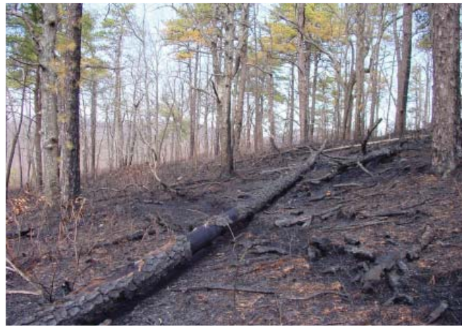
Research has shown the value of this type of low-intensity burn for Table Mountain pine regeneration. This photo shows a site three days after the fire.

The greater number of hardwood and shrub sprouts in areas of high- and medium-high intensity continued for the first six years, and in all areas the hardwood sprouts overtopped the pines at six years. At this time, the hardwoods were approximately 7 feet tall while Table Mountain pines were 3 to 4 feet tall, and pitch pines were 2 to 3 feet tall.