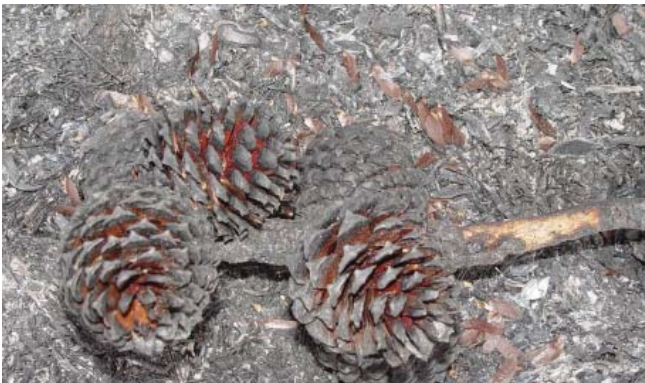
Open serotinous cones of Table Mountain pine two days after burning. These show the promise of successful regeneration.

The research did not demonstrate that fire intensity was the controlling factor for Table Mountain pine regeneration. Researchers believe an important factor may be the presence of cones on the trees in the fire area, and the degree of openness of those cones. This suggests that it may be appropriate to do a cone survey before planning a prescribed fire to help estimate the potential value of the fire for cone-based regeneration.