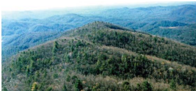
View of a mountain ridge in north Georgia that shows a mixture of Table Mountain pine, pitch pine and chestnut oak.

that ridgetop pine communities in Georgia and South Carolina were created and maintained by multiple low-intensity fires rather than more infrequent higher-intensity fire.