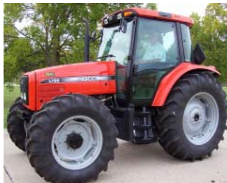
AGCO LT 90 Diesel

Institute of Agriculture and Natural Resources University of Nebraska-Lincoln