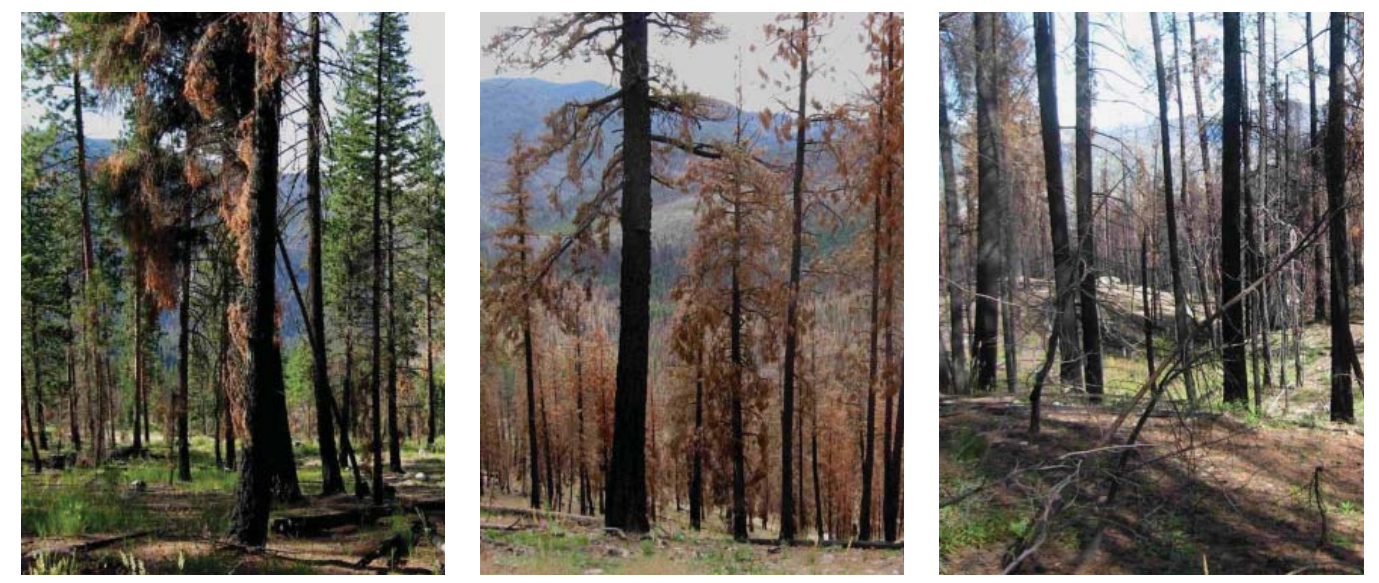
These photos demonstrate the striking difference in fire severity and treatment effectiveness between the three different methods (at different locations). From left to right: thin/prescribed burn, thin only, and control.

Prichard stated, "I was surprised that the small units fared as well as they did. Small units, less than 15 acres, that had been mechanically thinned and prescribed burned appear to have been just as effective as larger units (more than 37 acres). The reason I would expect small units to not perform as well as large units is that they have a greater amount of edge than larger units and therefore should provide less of a buffer from high-intensity fires surrounding the units. We didn't have a large enough sampling of units to statistically evaluate the effect of unit size, but it appears that overall tree mortality was similar across a range of unit sizes (11 to 55 acres)."