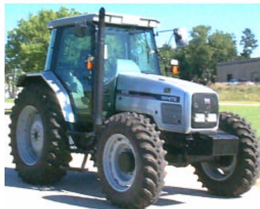
White 6710 Diesel