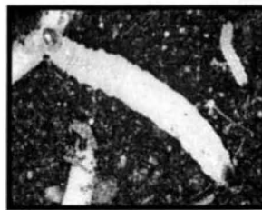
1. No feeding damage

Root damage from rootworm feeding can be rated using the Iowa injury rating system (see figure). Before corn plants can be rated for injury they need to be at a growth stage where at least three root nodes are clearly visible. Dig at least 10 randomly selected plants from several areas of a field, leaving a 9-inch cube of soil with the root system. Wash the roots to remove soil and rate each plant for injury using the rating scale. The relationship between root injury rating and yield loss is complex, but usually a root injury rating of 3 or more is needed to cause economic yield loss. The corn plant has the capacity to regrow roots and compensate for some early season injury, especially if soil moisture and fertility are adequate during regrowth. If several weeks have passed between the end of rootworm injury and the time of root rating, new root growth may hide the injury. Examine roots carefully to accurately rate them.