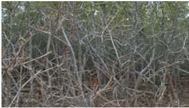
Close up of oak stripped brush in treated area.

“Then on July 16, 2001 it was like Christmas,” says Voth, referring to the start of an accidental fire on the base. “An artillery training exercise ignited a fire, which spread quickly to where the goats had been working. All of a sudden we had the perfect opportunity to see whether the treatments worked.”