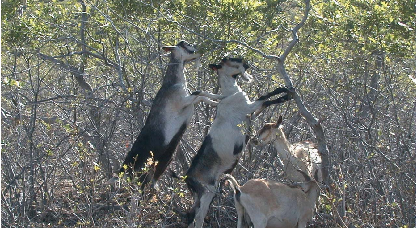
Goats at work in sagebrush.