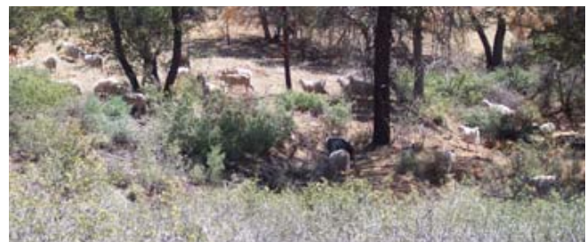
Goats work the Prescott National Forest.

“I learned something important about myself in that experience: I knew I wanted to find other ways to help prevent fires.”