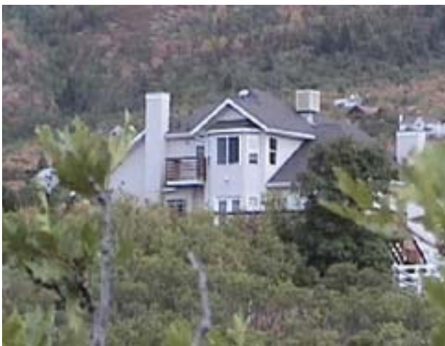
A home in the WUI surrounded by oakbrush.

Goats can quietly eat shrubs in hard-to-reach places very close to human residences. They keep the air clean and residents feeling safe. Goats naturally and cheaply do with gusto, what humans have set up enormous and costly infrastructures to deal with—namely manage fire-suppressed wildlands to prevent damage to homes, wildlife and wildlands, and people. Still, managing a goat herd may not pique everyone’s interest or abilities. However, since goats eat fuel, they may be a viable option for managers and planners looking for a cost-effective fuel management technique in the WUI.