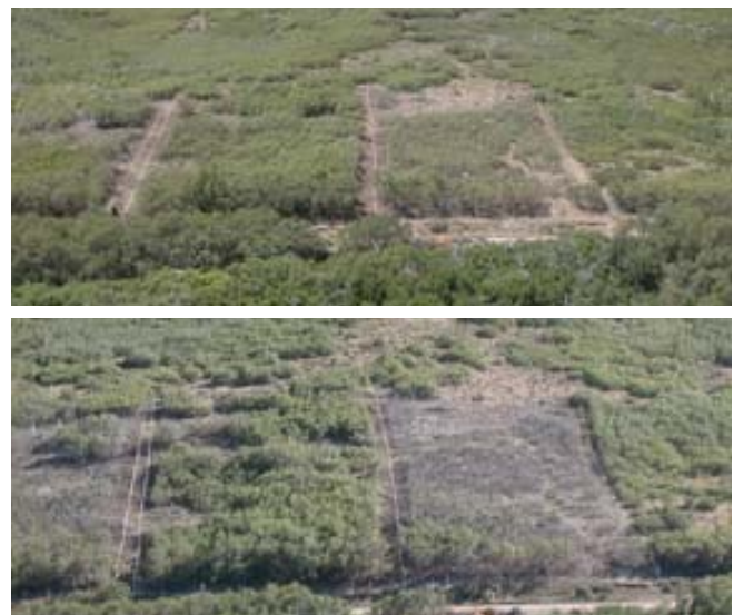
Photos showing two treatment enclosures before (top) and after (bottom) goat treatment.

Early in the process, the team had results they were excited about. The vegetation reduction experiment, for instance, showed quickly that goats are very successful at reducing biomass. For the 2,000 pounds of goats (about 17 animals) to graze down one paddock to 95 percent of original biomass levels, it took only about 10 to 14 days. That pasture was allowed to regrow for four to five weeks, then goats came in again, and took just a few days to bring the vegetation back down to those levels.