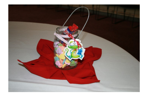
Center Pieces on tables