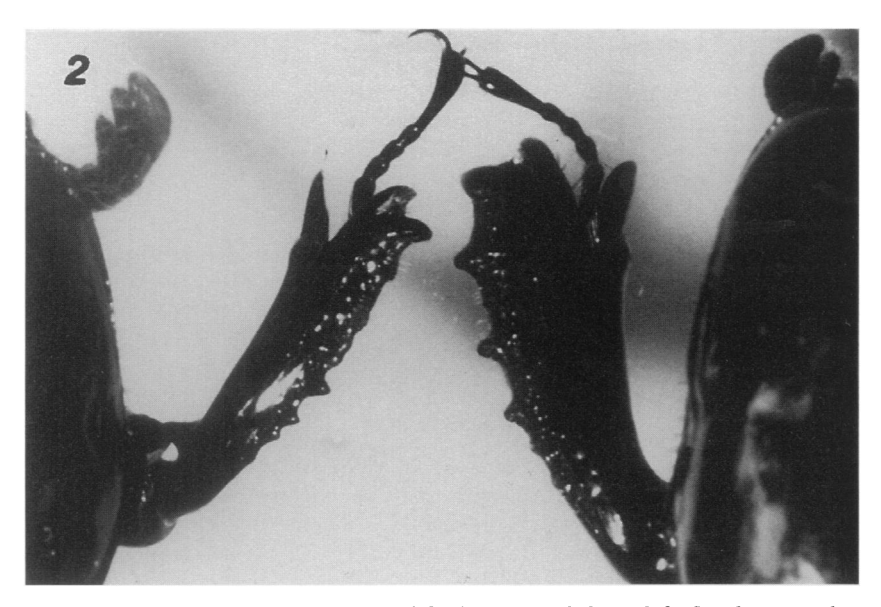
Fig. 2. Dorsal view of front tibiae of O. disjunctus (left) and O. floridanus (right) showing size difference.

DIAGNOSIS. The adult is most similar to O. disjunctus . The latter species differs from O. floridanus in having a rounded canthus which projects beyond the eye margin, larger eyes (dorsal eye width to head width ratio 1:9.5 - 1:10), mentum with dis-