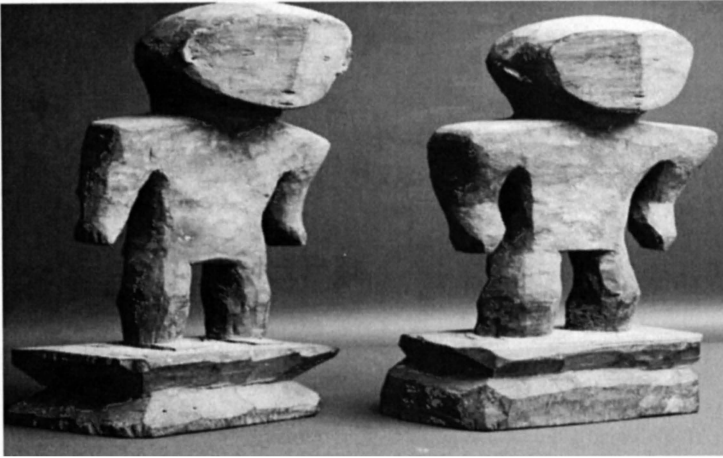
Figure 3. Sacred Ifugao Bululs (Kortmann 2009).

attracting tourists but the lack of maintenance and tourist pollution is currently deteriorating them (Calderon, et al. 2009).