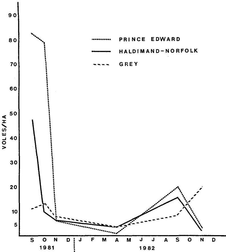
Fig. 2. The number of meadow voles ( Microtus pennsylvanicus ) per ha live trapped in apple orchards in three regions of Ontario.