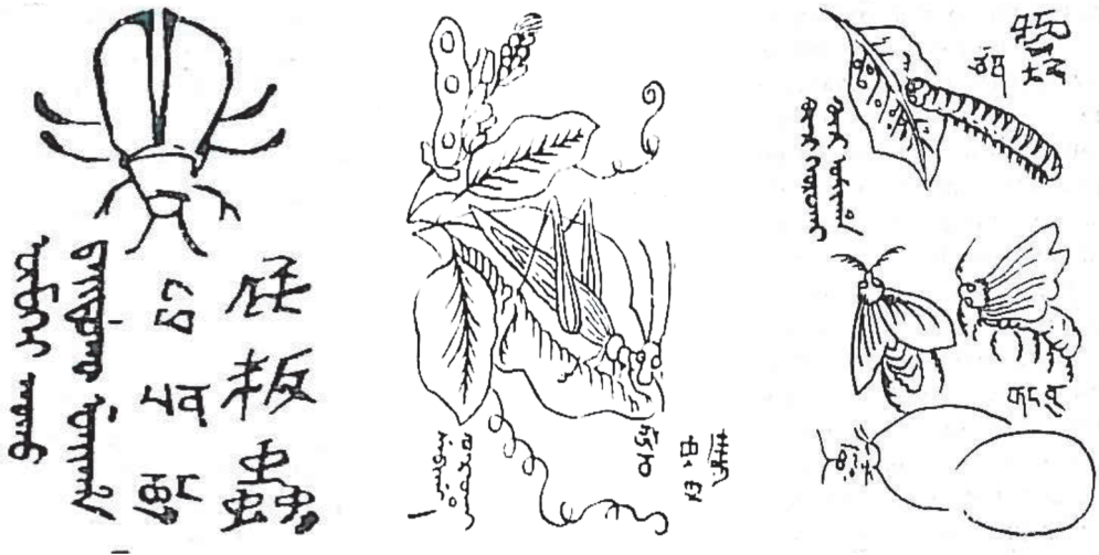
Fig. 1: Illustrations of some insects used in traditional medicine in an ancient medical book/sutra JAMBALDORJ (XVIII century).

The medical application of specific plants for long periods, e.g. in traditional medicine, indicate the presence of biologically active substances in plants.