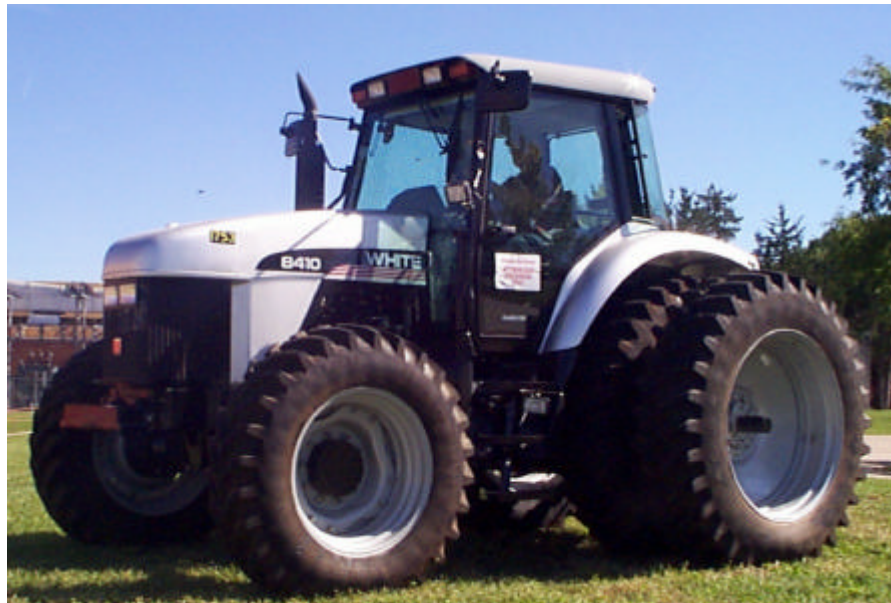
White 8410 Diesel