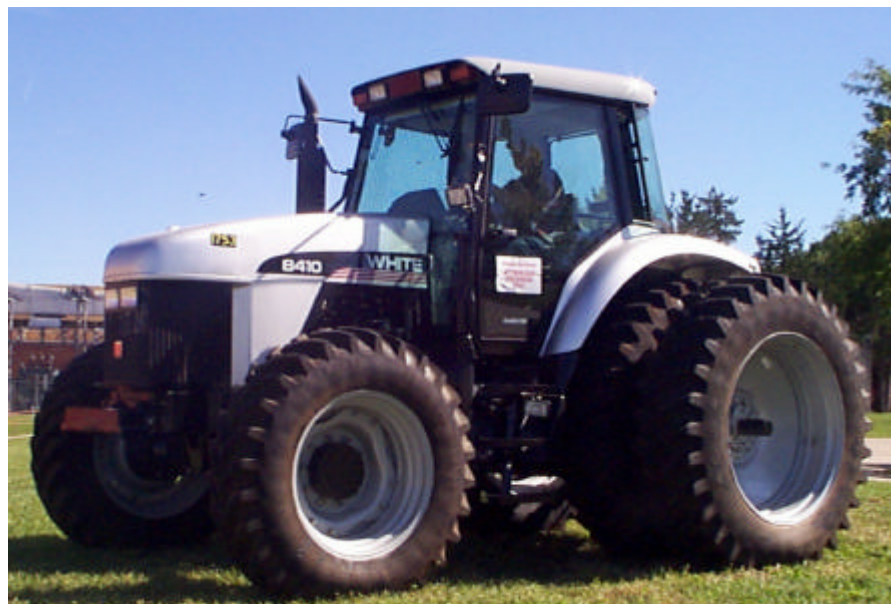
White 8410 Diesel