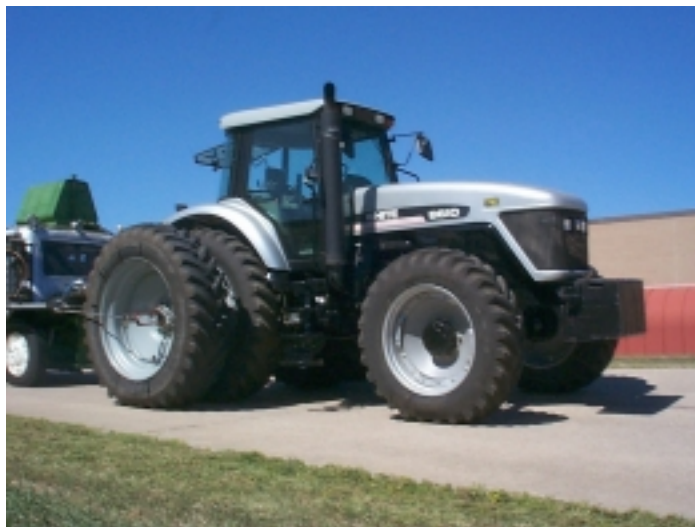
White 8610 Diesel