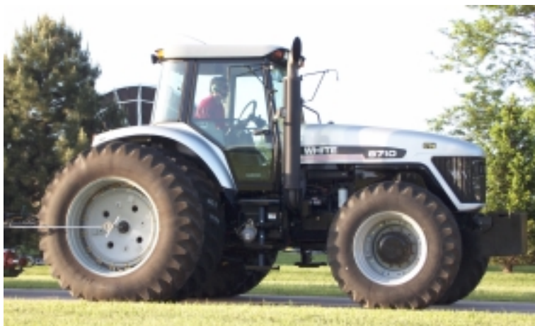
White 8710 Diesel