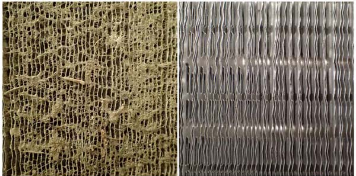
Close-up of 7 grams of dirt per square foot on an air conditioner condenser and that same condenser after it's cleaned.

the dirty air conditioners, then washed them thoroughly with a garden hose and tested again. We also used a commercial coil cleaning fluid and tested them for a third time.