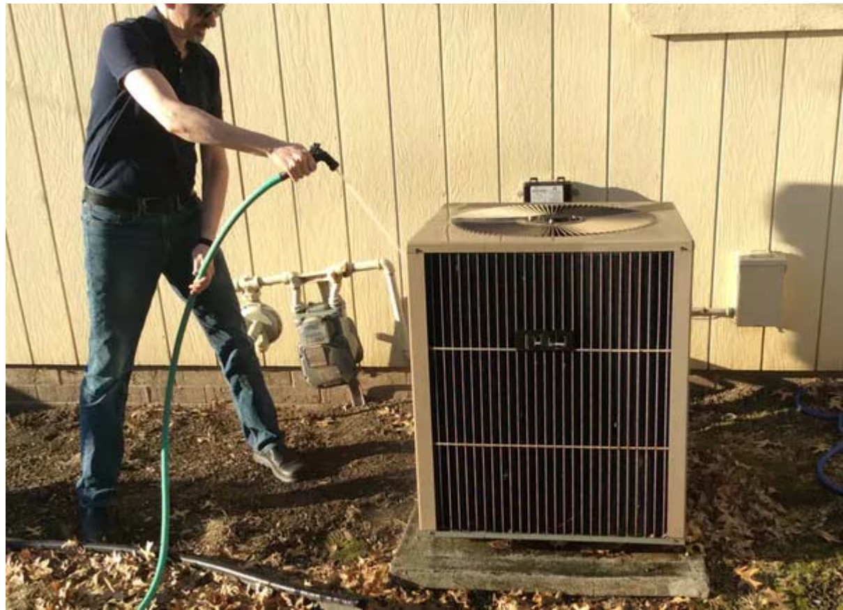
The author, doing a chore that his own research has found to be pointless.

Cleaning your air conditioner might make it run better. It might make it run worse. But it probably won't make any difference. I now personally believe in skipping this task, unless the coil is so dirty that it's hard to see the metal fins. Although, if it will make you feel better, go ahead and hose it down. To be honest, that's what I plan to do from now on.