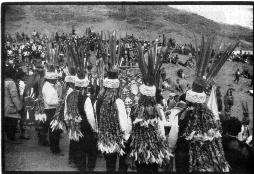
Figure 1.1 and 1.2. Costumed dancers at the annual pilgrimage of Qoyllur R'iti, Colque Punku, Ausangate, Peru. In 1.1, Chuncho dancers re-enact mythological tales wearing head dresses of makaw tail feathers. In 1.2, dancers' costumes incorporate local traditional textiles with Qocha pallay.