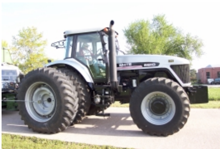
White 8810 Diesel