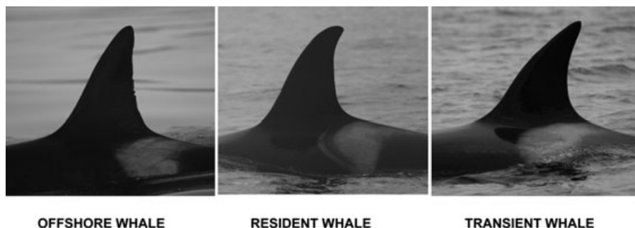
Figure 1. Photographs depicting morphological differences in killer whale ecotypes.

Morphologically, offshore killer whales more closely resembled resident (fish-eating) killer whales than transient killer whales. However, offshore killer whales appeared to be smaller than either the resident or transient ecotype. For example, large offshore males were roughly the size of adolescent males in the resident communities, and less dimorphism was observed between the sexes. In the offshore killer whale ecotype, the tip of the dorsal fin was rounded like those of resident killer whales but more so, being round over the entire tip. Many offshore killer whales had multiple nicks on the trailing edge of the dorsal fin. Their saddle patch shape was similar in size to that of resident killer whales and was usually closed ( i.e. , no intrusion of black pigmentation into the gray saddle); however, the saddle patch showed more variation than that described for transient killer whales (Baird and Stacey 1988).