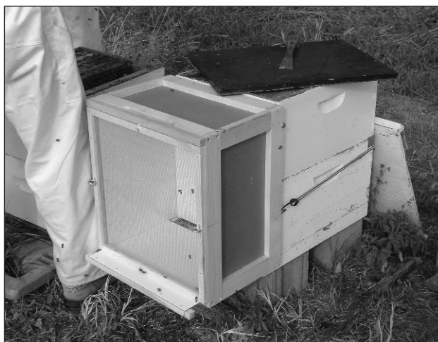
FIG. 1. Solid bottom bee-box attached to a colony prior to isolation of the adult bee population.

the mite per bee ratios were determined using the alcohol wash method.