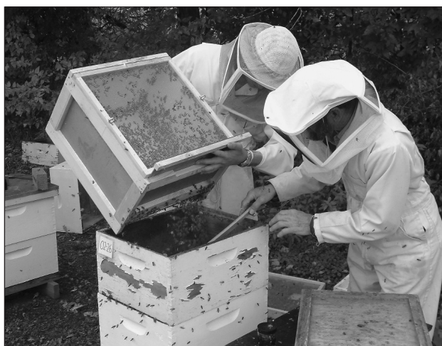
FIG. 2. Returning bees to their colony after dusting with powdered sugar.

We used a repeated measures experimental design model to analyse the combined mite per bee ratio data of all three apiaries. We considered three factors: (1) apiary location (Pawnee Lake, Denton, and East Campus), (2) treatment (powdered sugar and no powdered sugar), and (3) alcohol collection time (pre-treatment and 2 days post-treatment). Each hive was considered a block, thus the subject effect was [hive (location*treatment)]. The experimental and sampling units were both the colony. We used an unstructured covariance model and the Kenwood-Rogers degrees of freedom adjustment. We analysed data using