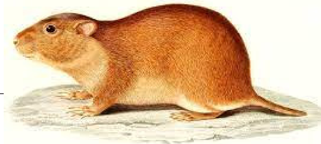
Brazilian tuco-tuco ( Ctenomys brasiliensis )