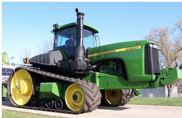
JOHN DEERE 9400T DIESEL