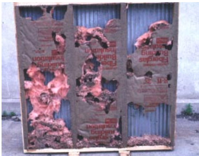
Figure 2. House mouse damage to a panel insulated with fiberglass batt after 6 months of exposure.

food (Wayne Rodent Lab-blocks) and water throughout the experiment. Enclosures were vacuumed two times per week to remove discarded insulation, waste food, excrement, and dead mice. Dead mice were identified and recorded throughout the 6-month period.