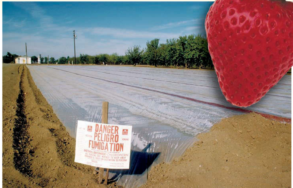
Jack Kelly Clark

The DPR's use regulations are administered through a permit process. In order to apply a restricted-use pesticide,