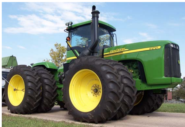
JOHN DEERE 9120 DIESEL