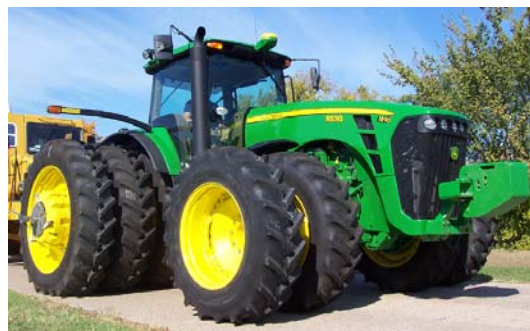
JOHN DEERE 8530 IVT DIESEL

Institute of Agriculture and Natural Resources University of Nebraska-Lincoln