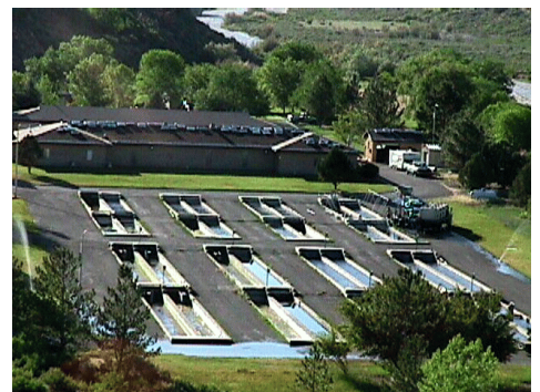
Overview of outside raceways; USFWS

Hotchkiss NFH helps in many ways. Currently, the hatchery produces trout to fill needs throughout Colorado and New Mexico. These fish help to