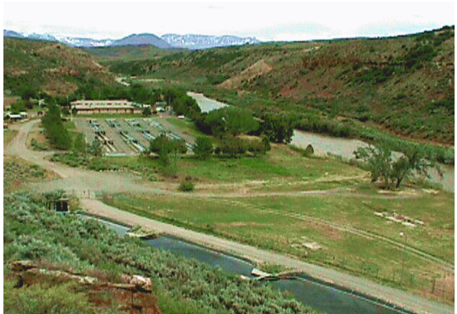
Hotchkiss National Fish Hatchery on the North Fork of the Gunnison River

Hotchkiss NFH is located about 3 miles south of the town of Hotchkiss and ½ mile east of Lazear, Colorado. Come prepared for a day of fun!