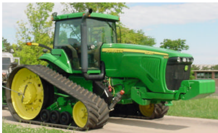
JOHN DEERE 8520T DIESEL