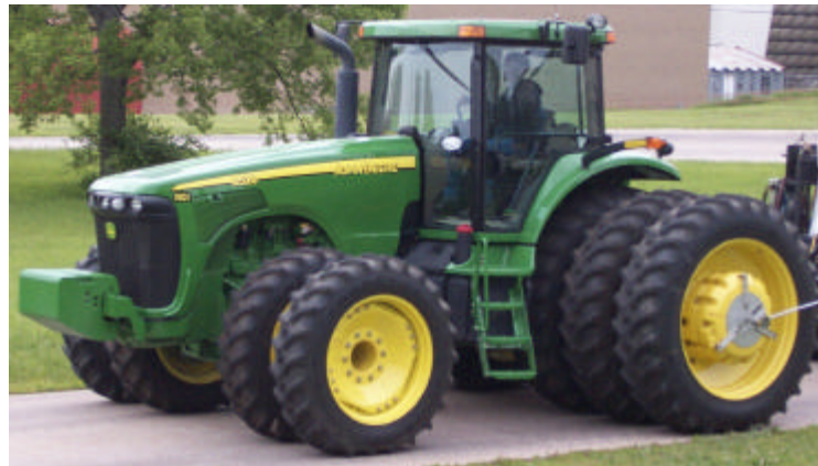
JOHN DEERE 8520 DIESEL