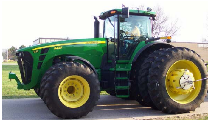
JOHN DEERE 8430 IVT DIESEL

Institute of Agriculture and Natural Resources University of Nebraska-Lincoln