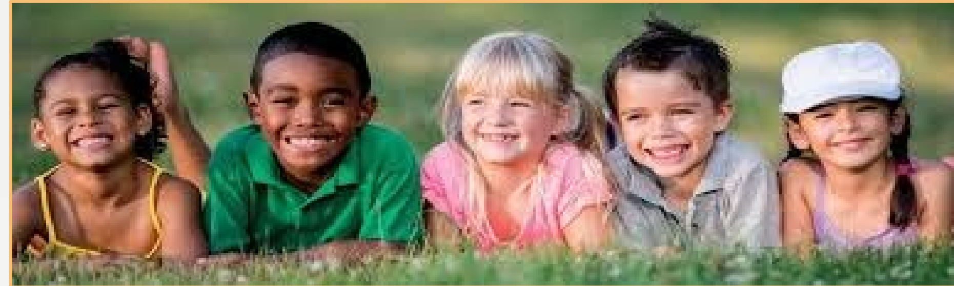
Neglect is the most common type of maltreatment perpetrated against children